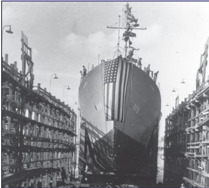
USS Pocatello Launch, October 17, 1943